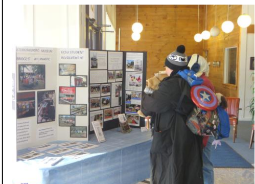
Visitors look over the tri-fold picture boards at the 2016 Chocolate Festival.