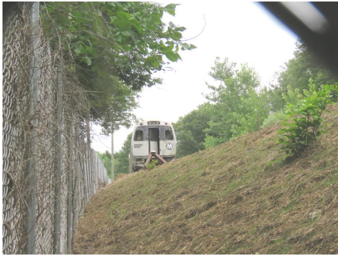
This photo shows the view the embankment which starts here and goes off to the left towards the P&W trackage. We are working on expansion plans – see story inside.