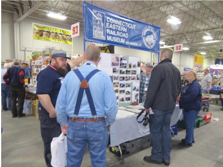
This photo shows visitors talking with museum members at the Amherst Railway Soc. Big Train Show.