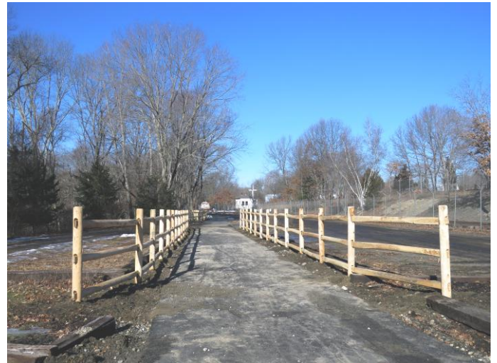
This photo taken by our parking lot shows the trail and the wooden fence that runs alongside our driveway. See article inside.

Connecticut Eastern Chapter, NRHS, Inc. Connecticut Eastern Railroad Museum PO Box 665 Willimantic, CT 06226