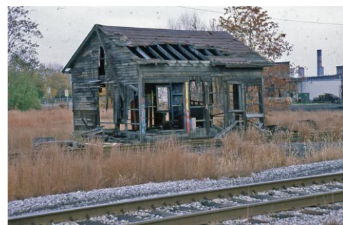
From the Archives – Here is a photo taken Nov 1990 of the New Haven RR Section-house as it sat in the yard at Willimantic, CT.