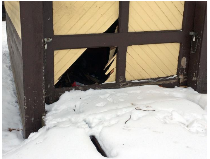
Sadly, we had some unwanted visitors in the last few weeks. Please see the article for details.

Connecticut Eastern Railroad Museum PO Box 665 Willimantic, CT. 06226-0665