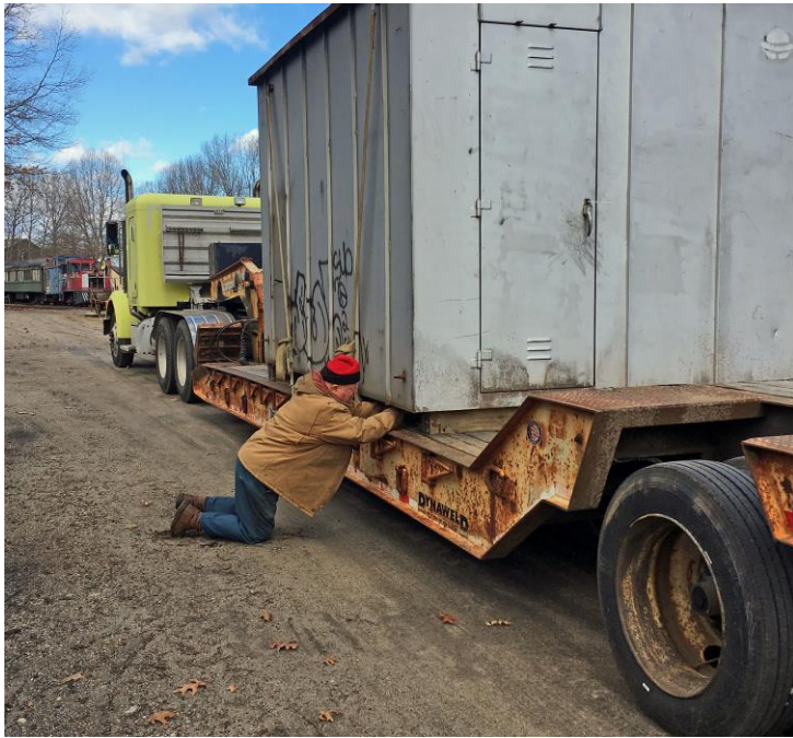
Adrian releases the straps on the Central Instrument House (CIH) from the CT DOT