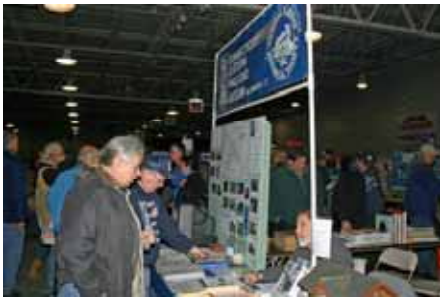
The museum once again had a display at the 2007 Amherst Railway Soc. 'BIG' Train Show held 1/27 & 1/28/2007.