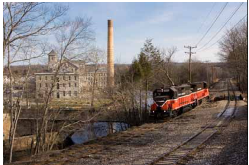
Twenty-five years later on 1/25/07 another P&W train arrives at Willimantic, CT. This time in the form of a two locomotive test train. Willimantic should once again hear the sounds of another railroad coming to town.