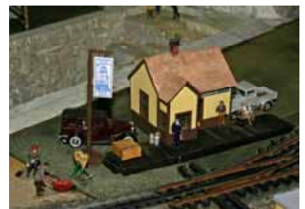
At the Amherst Train Show I noticed a beautifully detailed model of the museum's Chaplin Station. It was in the layout run by The Connecticut Society of Ferroequinologists and Model Railway Engineers out of Manchester, CT.

Please note – monthly business meeting will be held on Mar. 4, 2007 at the same location at 7:00 PM. All members are welcome and encouraged to attend.