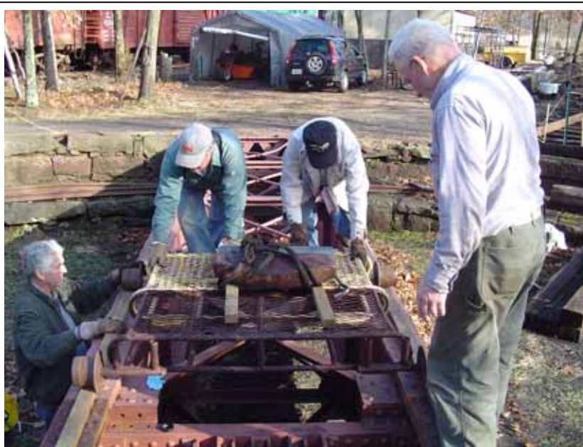
Museum members move the turntable rocker assembly across the turntable bridge via home built tracks. The bearing has already been installed and the last piece to go in was the rocker assembly. Once this was completed the bridge was turned to align it with Pit #1. See photo page 2 of this GTJ. Next step installation of ties and ring rail and some pit work. Watch for information on a turntable dedication ceremony in future issues of Ghost Train Journals.

With all the new track this year's shoot should for many more interesting angles to get great images in and around the Columbia Junction Village. Many volunteers will be needed – more details to follow.