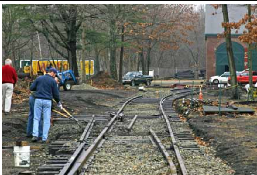
Trackwork continues at Columbia Junction. This view shows the track going to the right goes over to the turntable area, while the one on the left will connect to the Air Line. This is a key piece of track as it will allow us access via the turntable to all six tracks inside the Columbia Junction Roundhouse. Photo taken Jan. 13, 2007.