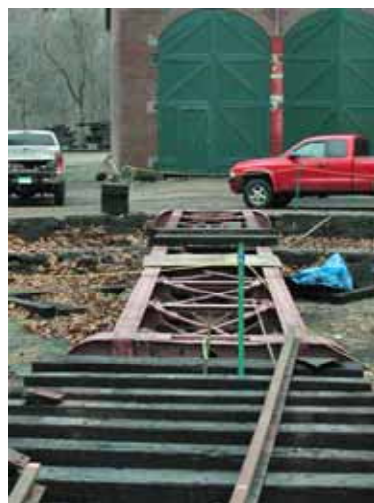
Success at Last!!!

The year 2007 started off on a very high note at the Columbia Junction Roundhouse now that the turntable bridge bearing assembly and the rocker assembly have been installed on the bridge. Also the turntable was turned so that it is now aligned with Pit #1.