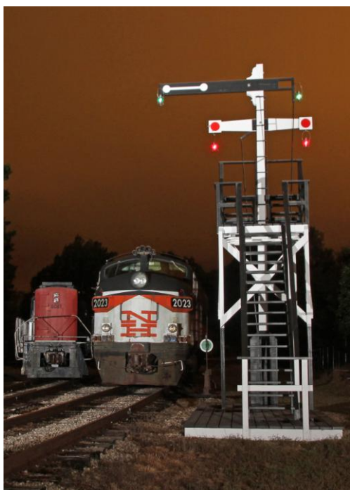
Don't forget 10 th Annual Night Photo Shoot – Saturday October 12, 2013 – New Layouts Planned! See Details Previous Ghost Train Journal.