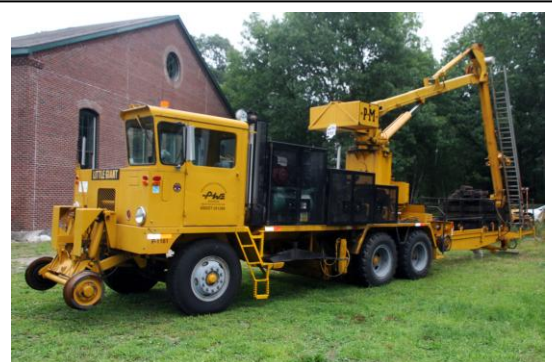
We thank the P&W Railroad for sending their Hi-Rail Bridge Crane Truck to Railroad Day.