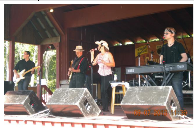
While visiting the Hebron Harvest Fair, Chapter Vice President played for the crowds.