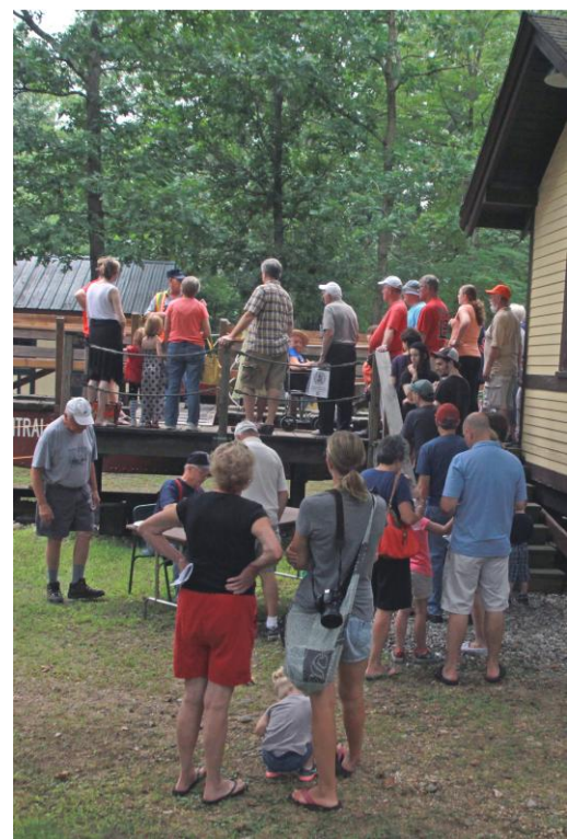
Waiting for a train during Railroad Day at the Museum.