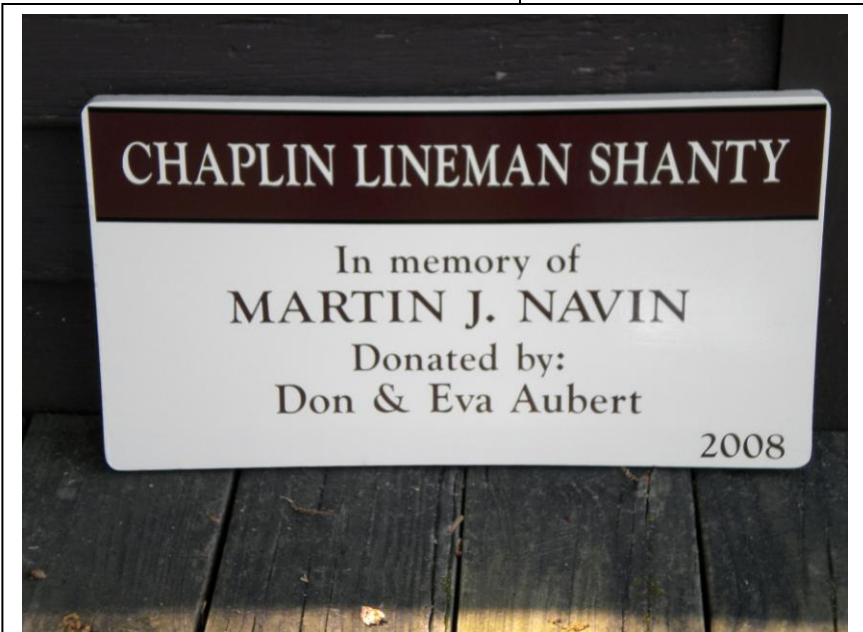
A nice new looking sign has been made for the Chaplin Line Shanty at the museum.