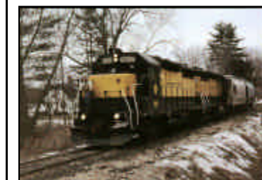
The conductor of NX-13 rides the front "porch" as the train makes it's way to Specialty Minerals in Canaan, CT, dropping off two loaded hoppers.

On the crisp late winter morning of March 23, 2003, I arrived in the Canaan, CT area at about 7 AM, well in advance of NX-13's departure from the engine house. So I decided to check out the Canaan Station - a recent victim to arson, started by some teenagers. Most of the structure is still standing, but is fenced off due to obvious safety concerns. The burned out sections, which were to the left in the photograph above, were removed leaving only the foundation, and the remaining part of the building was sealed off. I'm sure it was a beautiful building when it was in use, and perhaps, someday in the future, it will return to it's splendor. As of this writing, the Canaan Historical Society was in the process of getting a grant to rebuild the burned down sec-