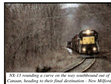
NX-13 rounding a curve on the way southbound out of Canaan, heading to their final destination - New Milford

Once the crew was done with their duties at