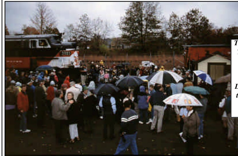
The FL-9 and 44 Tonner meet at the Versailles Shanty for the Ceremony. Despite the rain, the turnout was excellent!