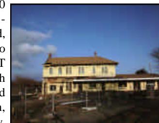
The remains of the Canaan Station in Canaan, Connecticut

Never having railfanned this road, I decided to hit the road early one Sunday, and catch train NX-13 before it leaves the Canaan area for it's final destination - New Milford, CT.