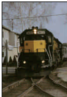
GP-20M #3602 leading NX-13 in some switching moves before heading south.

Just as I was finishing up at the station, I heard