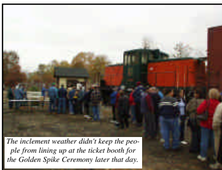
The inclement weather didn't keep the people from lining up at the ticket booth for the Golden Spike Ceremony later that day.

Overall the museum had a very successful day in spite of the rainy conditions. Lots of good memories were made that day as people went home happy.