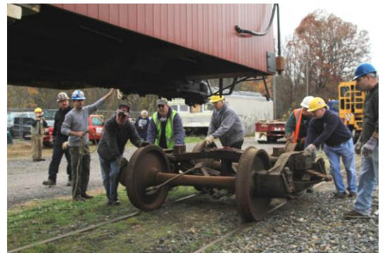
The museum's truck crew moves one set of wheel trucks towards the caboose.