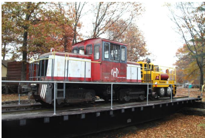
A few days before we received our newest addition, the equipment in the roundhouse needed to be rearranged. Shown here the New Haven Terminal GE 45 ton was taken out of the roundhouse and delivered to another location at the museum.