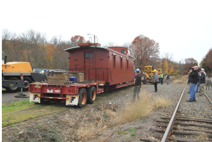
This photo shows the truck being directed backwards so the caboose can be off-loaded and put on its own trucks. A complete story in a special issue is planned. So stay tuned.

Connecticut Eastern Chapter, NRHS, Inc. Connecticut Eastern Railroad Museum PO Box 665 Willimantic, CT 06226