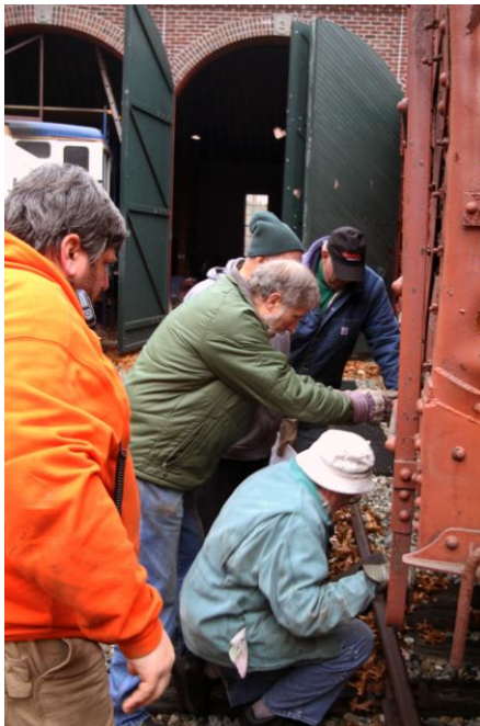
When moving the CV box car from one track to another in the roundhouse there was a major discussion on how to move a leaning box car through the doorway safely.

The following photos will show our newly acquired 1927 Rutland RR Caboose Number 40.