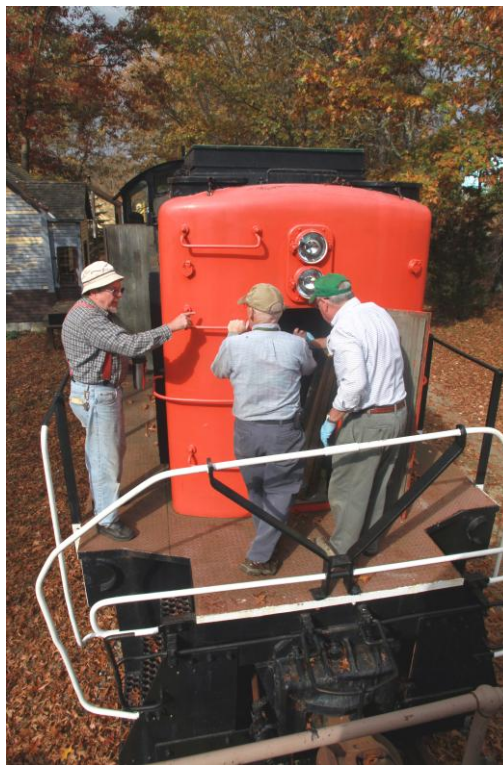
The continued discussions about oil flow brought the group to the nose of the Alco S4.