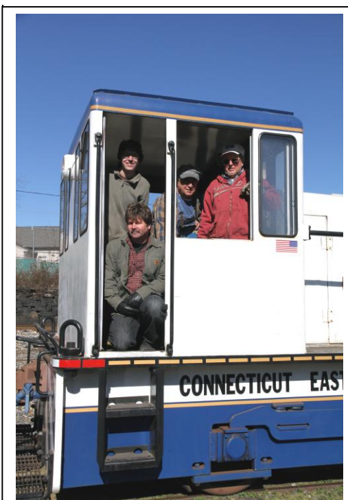
Our last 2012 train to Bridge Street turned out to be a Blacksmith Special. Shown here members of the Connecticut Blacksmith Guild enjoy their ride.