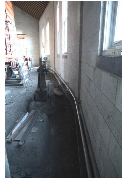
This photo shows the Compressed Air System air-lines along the back wall of the roundhouse.

Alaska Railroad – Moose Gooser Boston & Maine – Busted & Mangled