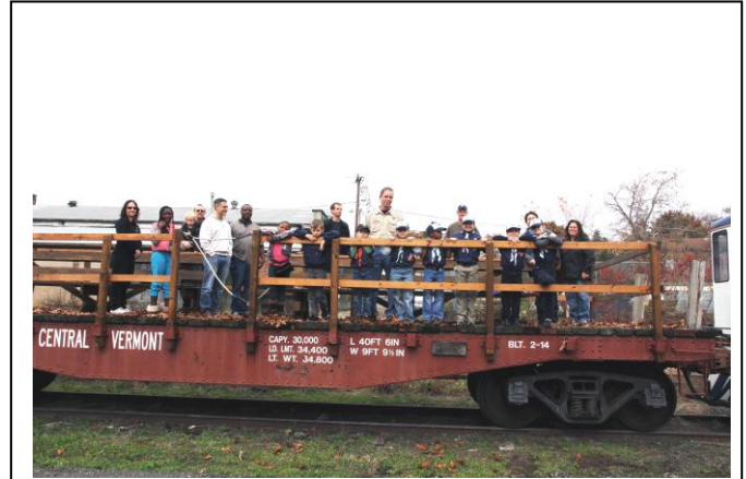
Scout Day at the Museum turned out to be pretty successful. In this photo Mansfield Bear Scout Pack 61 pose on train at Bridge St. Another group came in the afternoon – see inside.

Connecticut Eastern Chapter, NRHS, Inc. Connecticut Eastern Railroad Museum PO Box 665 Willimantic, CT 06226