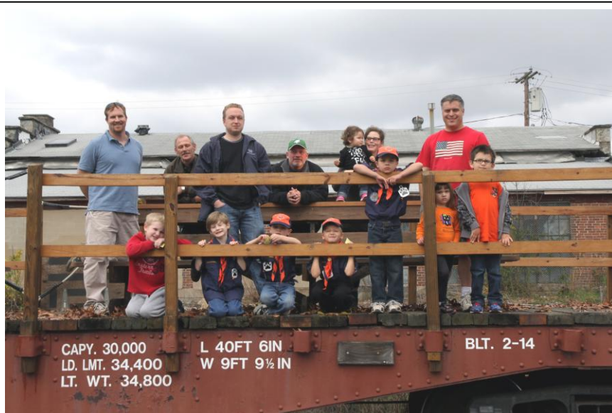
The above photo shows Ashford, CT. Tiger Cub Scout Pack 92 along with family and friends on the train at Bridge Street.