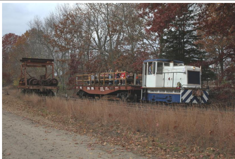
The above photo shows one of the Extras moving along the 'Air Line' on its way to Bridge Street.

More Railroad Nick Names – Delaware, Lackawanna & Western Delayed, Linger & Wait Lehigh & New England – Loose Nuts Everywhere