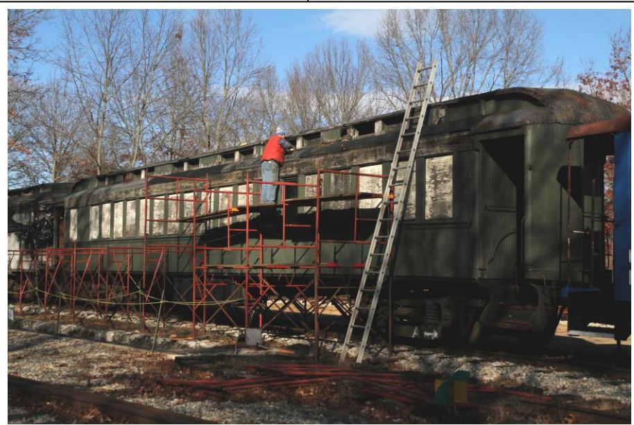
Adrian Atkins works on the roof our the museum's New Haven Coach to see what additional materials are needed to protect it from the elements over the coming winter months.