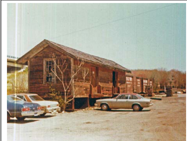
This photo by Dick Sobielo shows what the Groton Freight-house looked like in March 1976.