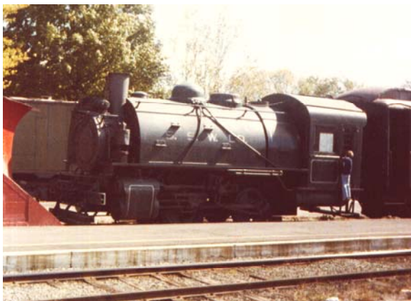
This photo taken at Essex, CT in Oct 1979 shows steam no. 10 while it was stored there.