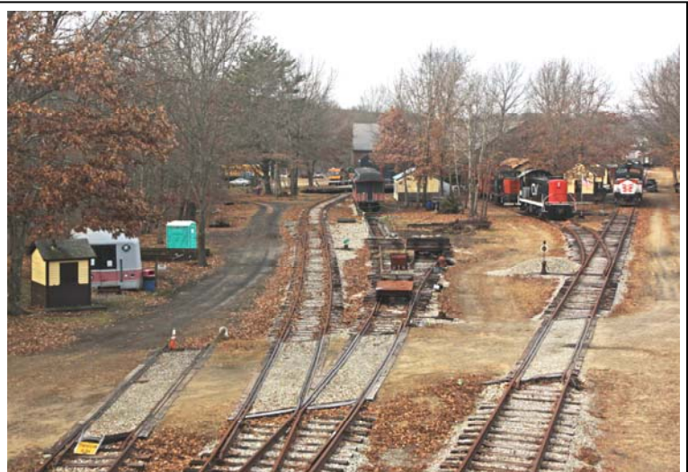
This is the view of the Village of Columbia Jct. from the top of the Gallows Signal. Just remember just a few years ago there nothing here except plenty of trees, scrubs, some well beaten paths, and nothing else.