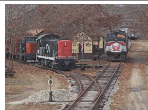
Another view from the Gallows Signal shows a power line-up in the Columbia Jct village area.