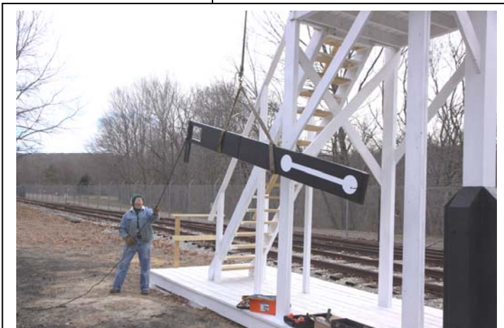
Bill Bouchelle holds onto guide rope as the upper sign board is lifted up to the upper platform where it will be installed see other photos within this issue.