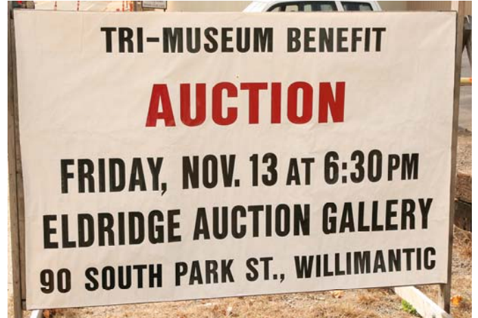
Here's photo of Tri-Museum Benefit sign at Bridge St.

MARK YOUR CALENDARS: 11/13/09 – Goods & Services Auction – Eldridge Auction House 6:30PM (Details Inside) 11/15/09 – Fall Train Show at Windham High School – Details Inside 11/22/09 – Monthly membership meeting – Windham Memorial Hospital – Election of Officers for 2010 will take place. 12/6/09 – Monthly business meeting – Windham Memorial Hospital – 7:00PM 12/20/09 – Monthly membership meeting – Windham Memorial Hospital – 7:00PM 1/3/2010 – Monthly Business Meeting – Windham Memorial Hospital – 7:00PM 1/17/2010 – Annual Banquet – Leventt's Restaurant – Columbia, CT – 2:00PM