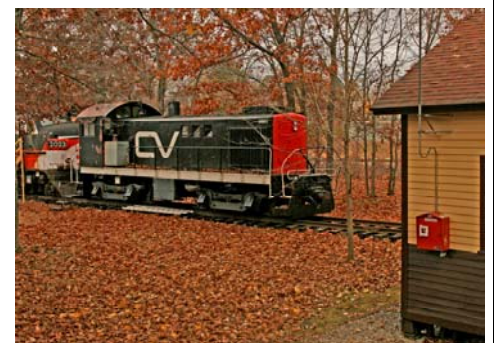
CV S4 and FL9 sit at Columbia Jct. awaiting their next assignments.