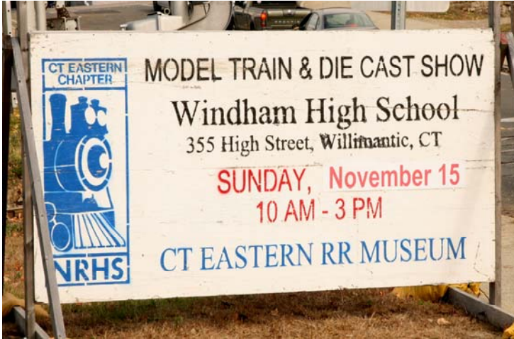
Here's another photo showing the Model Train & Die Cast Show sign at Bridge St. – (Robert A. LaMay)