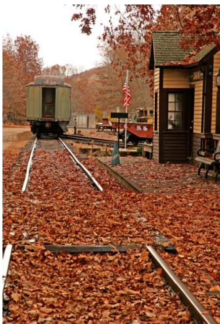
Looks like its fall at Columbia Jct. as the local pulls away from the station.