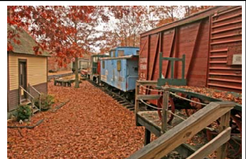
Looking out the Groton Freight-house window I snapped this fall scene at Columbia Jct.