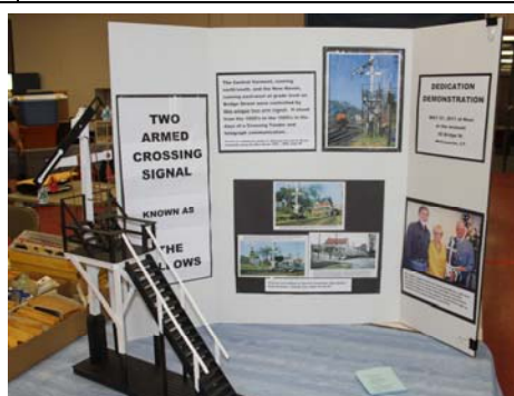
A display which included a model of the Gallows Signal along with some history and numerous photos was available for show patrons to look at.