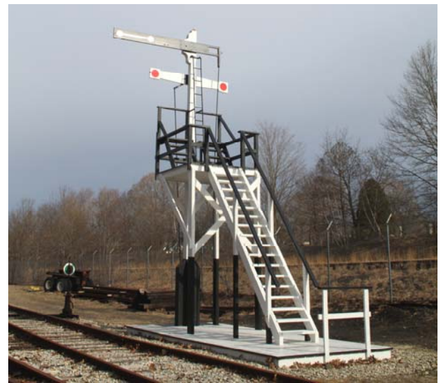
This is how the Gallows Signal looked on April 22, 2011. This signal will be dedicated and a demonstration given on May 21, 2011 at Noon.