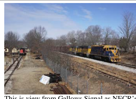
This is view from Gallows Signal as NECR's train 608 passes the museum.