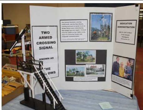
A display which included a model of the Gallows Signal along with some history and numerous photos was available for show patrons to look at.