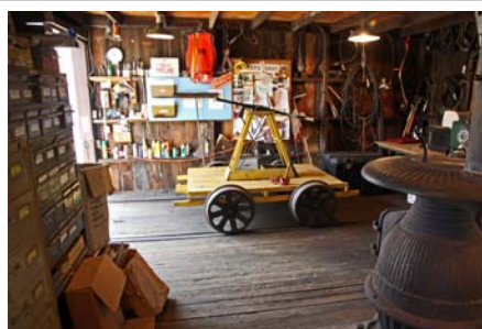
Here's an interior view of Willimantic Section-House showing the Hand Pump Car when not in use.