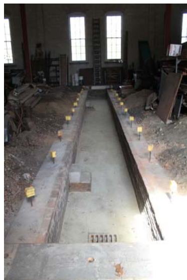
This photo shows the latest progress in Pit number 2.