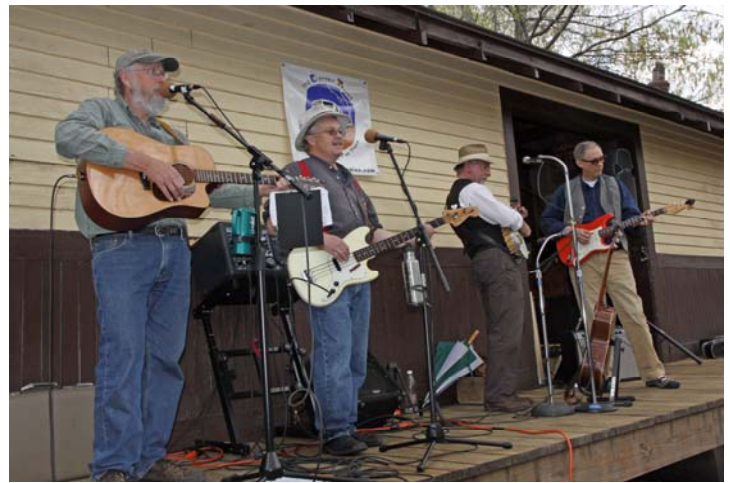
The musical group known as The Electric Trains performed some great music. Songs such as Airline and East Thompson, 1891 filled the air.