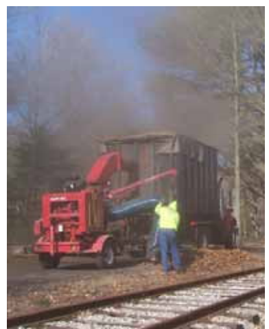
This photo shows a 'Super Leaf Sucker' picking up a seasons worth of leaves in preparation of the museum's opening of its 2010 season.