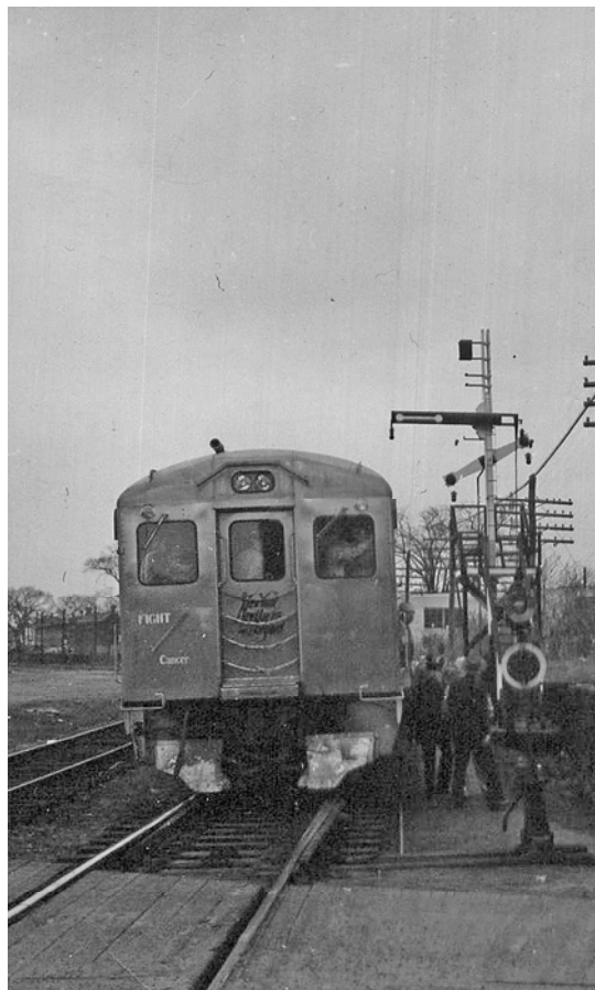
A New Haven RR RDC stops at the Gallows Signal at bridge St. Members of the Railroad Enthuiasts of Hartford get off to get a closer look. Members at the museum are currently preparing to build a working replica of this structure.