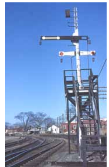
This mid 1950 photo shows what the Gallows Signal looked as it stood guard near Bridge St. in downtown Willimantic. The museum has started making arrangements to rebuild this historic structure.