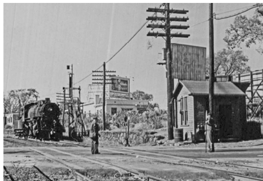
Taken in the mid 1950's, this Charlie Palmer photo shows a Central Vermont Railway locomotive passing the Gallows Signal as it approaches Bridge St.