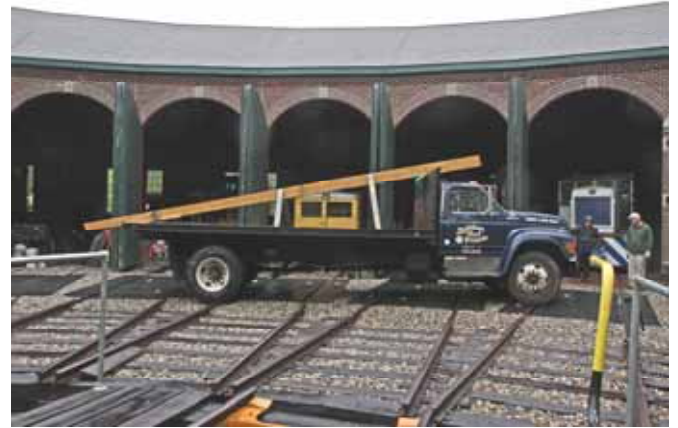
Ken Sigfridsen moves his truck across the front of the roundhouse carrying the 28foot timber which will be used in the building of the 'Gallows Signal' which used to stand near Bridge St. near downtown Willimantic, CT.

MARK YOUR CALENDARS: 5/30/2010 - Mass Bay Railroad Enthusiasts visit museum 6/6/2010 - Monthly business meeting - Windham Memorial Hospital - 7:00PM 6/27/2010 - Monthly membership meeting - Windham Memorial Hospital - 7:00PM