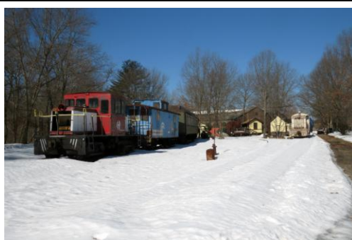
Anybody seen the Air Line tracks recently? Remember to stop by Opening Day – May 2 nd and you should see these tracks for yourself.