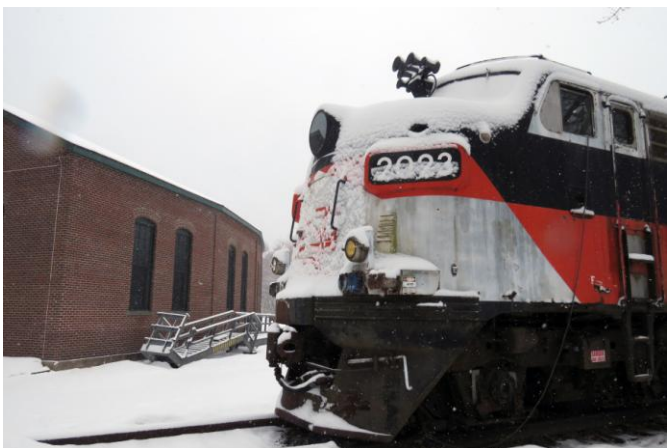
Would you believe this is the first day of Spring??? Who would have think?