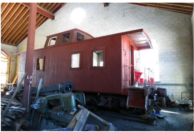
To the left – this photo Shows the progress on our Central Vermont caboose number 4052.