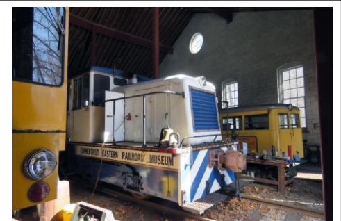
'Lil Tigger' waits for warmer days. In a few more weeks I'll be taking museum visitors for train rides.