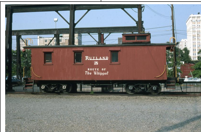
I purchased a 35mm slide at the Jersey Central Railroad show – it shows Rutland RR Caboose #28 at Steamtown at Scranton, PA. Built in 1920 and is 3" shorter than the number 40. Also note the truss rods and the logo 'Route of the Whippet'.