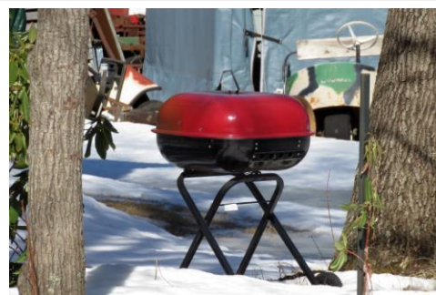
Remember – Metalfest – Saturday May 2, 2015. The snow will be gone. The coals will be hot! The blacksmiths will be busy. Come see the work!