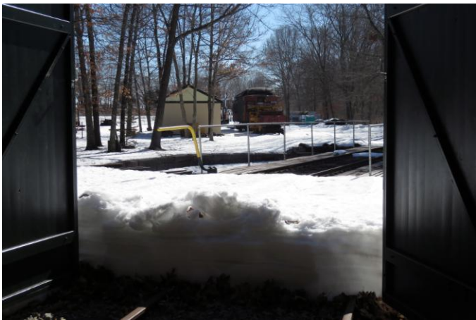
Ok, Now I see where our turntable went! At least we can see it now. Think the snow will be gone by opening day?