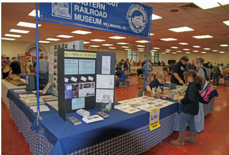
This is the museums display booth and tables at the Spring Train Show.