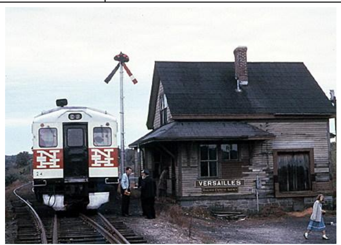
In this undated photo a New Haven RDC number 24 pauses at the old Versailles railroad station that once stood at Versailles, CT. (Photo sent to me from Jim Poor)

Remember we open May 5, 2012 for our 2012 season with Metalfest – Come hear the music, watch the demos, and take a train ride.