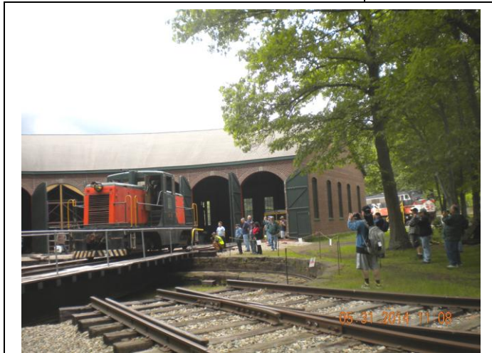
Members of Twin Forks Chapter NRHS and Railroad Museum of Long Island gather around turntable to see ex LIRR 400 take a spin.