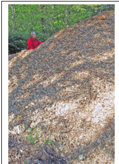
When you are up to your X&$# in chips – Hope you can swim.