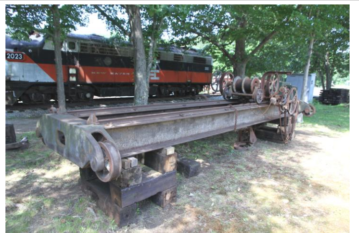
Museum's latest display is an overhead crane with a moveable trolley was used in a local factory.