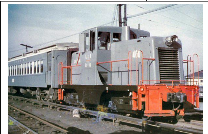
This undated photo shows LIRR 400 with train at unspecified location.