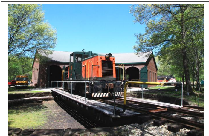
The above photos shows EX LIRR GE 44 ton sitting on the Connecticut Eastern Railroad Museum turntable at Columbia Jct.