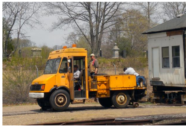
Museum's Hi-Rail truck takes a rail-Test run at the museum.