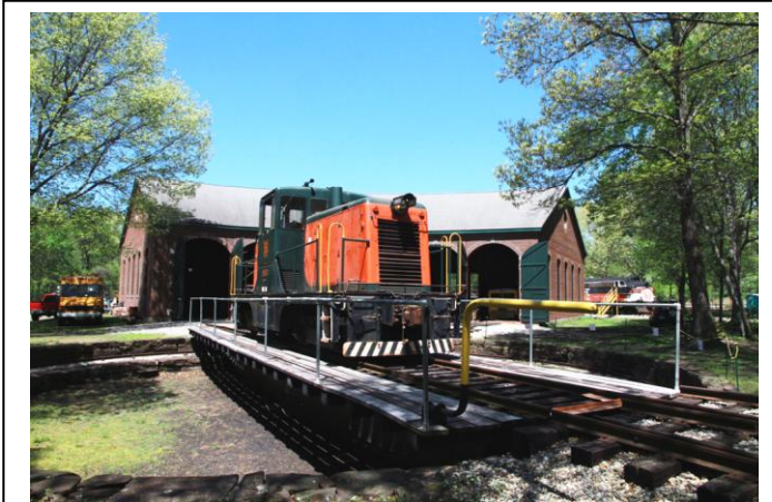
The above photos shows EX LIRR GE 44 ton sitting on the Connecticut Eastern Railroad Museum turntable at Columbia Jct.