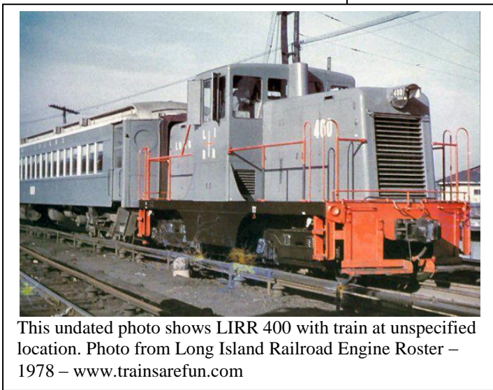
This undated photo shows LIRR 400 with train at unspecified location.