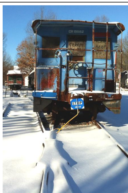
Winter at the Museum

If anyone has the opportunity to promote our endowment fund or would like more information please feel free to do so. A group such as ours needs to plan for the future and that may well lie in this fund