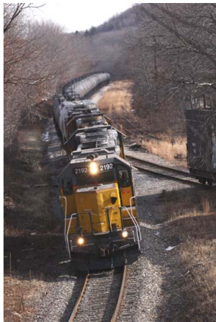
A faint whiff of snow and a few weeks before the Snow Gods turned ugly I got this photo from the Rte 66 overpass of an empty ethanol extra passing the museum going north.