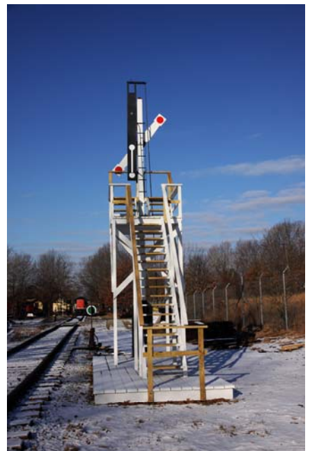
This is the view looking down the main line at the museum showing the placement of the Gallows Signal.