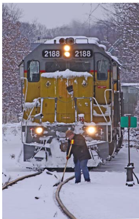
We've had a historic amount of snow here in January 2011. Here we see a NECR crewman sweeping snow away from the switch points. This photo was taken looking east at bridge St.