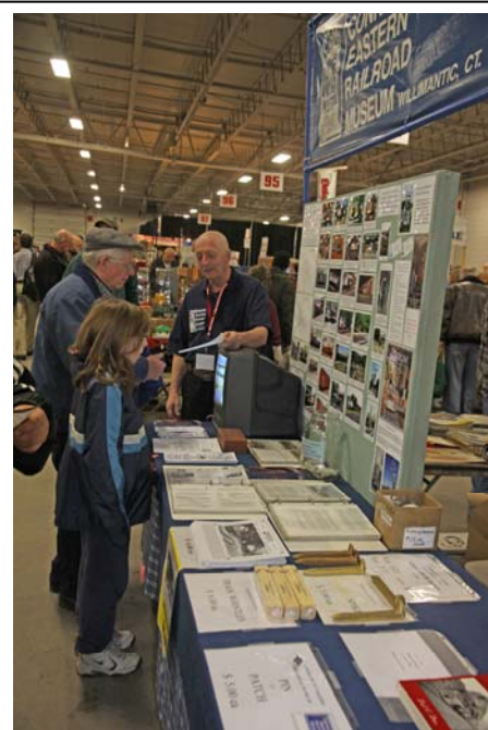
Visitors to the 2011 Amherst Railway Soc. Train Show visits the Chapter/Museum display tables.