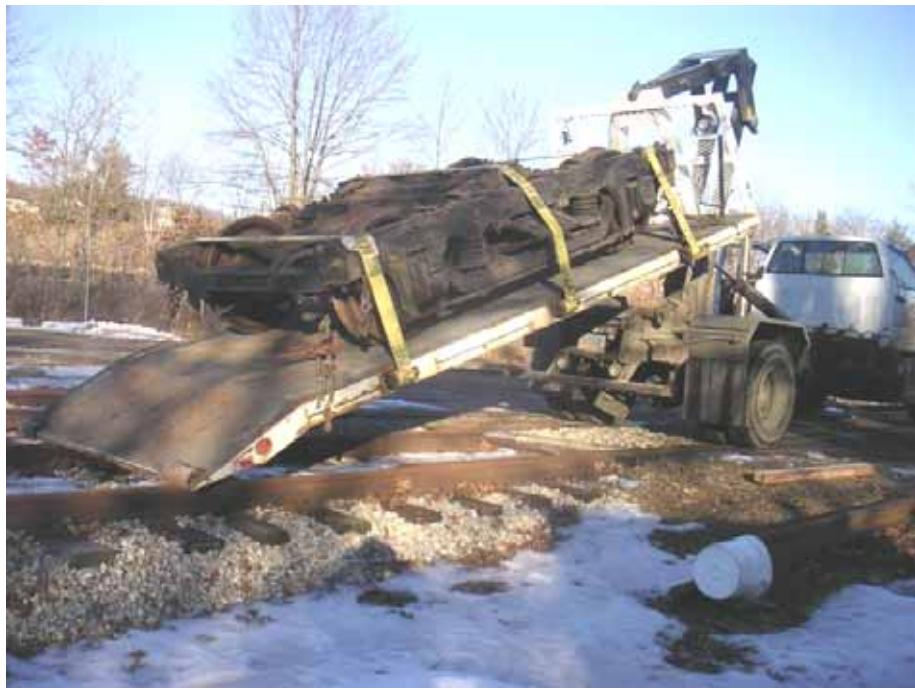
The first truck set from Wallingford, CT arrived at the museum and was unloaded. The body of the coach is in Wallingford awaiting the word it can be moved over the road to Willimantic, CT.