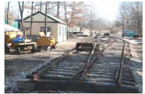
This 02/21/09 photo shows the latest progress to the Ash-Pit track which will pass next to the Blacksmith Shop, on the left.