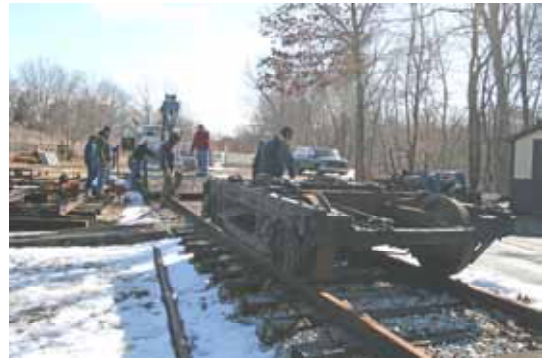
This shows the second wheel set after it was unloaded and the hook is about to be taken off.