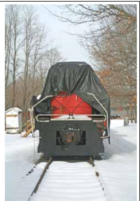
CV Alco S4 has its winter cover on and is in hibernation.