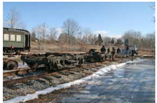
This photo shows both sets of trucks at the museum. Now we wait for the car body to be delivered.