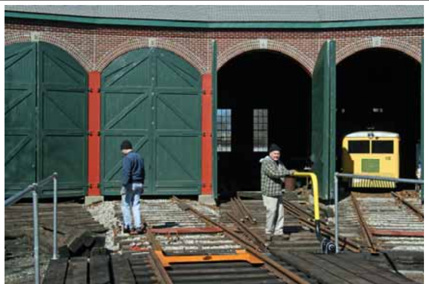
This 02/28/09 photo shows the progress on pit track number 4. See interior photo inside this issue for an updated view.