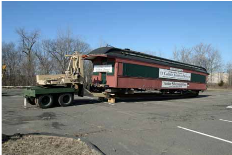
Ready to Roll. This photo taken 2/25/09 of the Yankee Silversmith dining coach in the old parking lot at Wallingford, CT. The sign on the side says 'Moving Soon to Willimantic, CT.