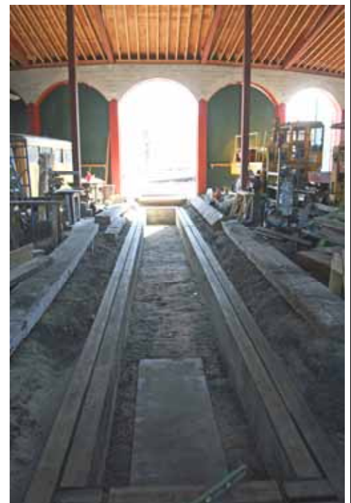
Pit 4 Update – 02/21/09