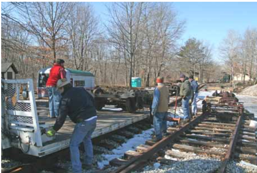
The second wheel set was delivered on 02/21/09 and is shown here being unloaded with the help of many museum members.