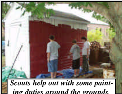
Scouts help out with some painting duties around the grounds.