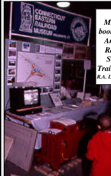
The Museum booth at the Amherst Railway Society Train Show..