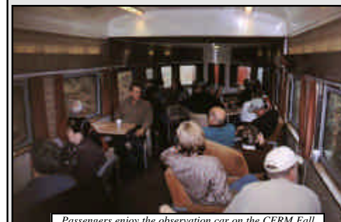
Passengers enjoy the observation car on the CERM Fall Foliage Excursion