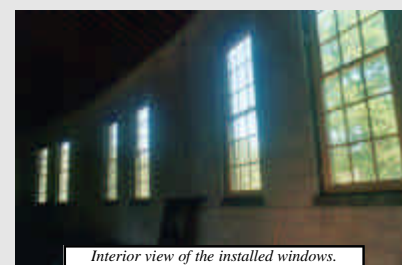
Interior view of the installed windows.