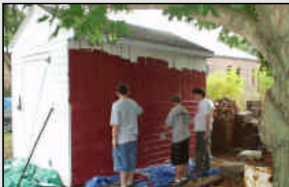
Scouts help out with some painting duties around the grounds.