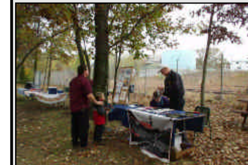
Operation Lifesaver table at the Ceremony promoting grade crossing safety and awareness.