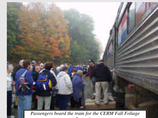
Passengers board the train for the CERM Fall Foliage Excursion