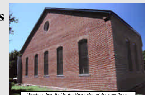
Windows installed in the North side of the roundhouse

Connecticut Eastern Railroad Museum & Connecticut Eastern Chapter, NRHS, Inc. P.O. Box 665 Willimantic, CT 06226