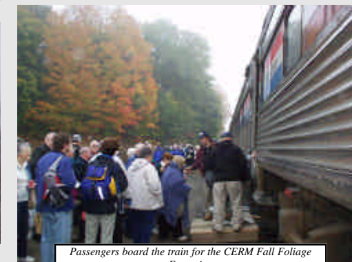
Passengers board the train for the CERM Fall Foliage Excursion