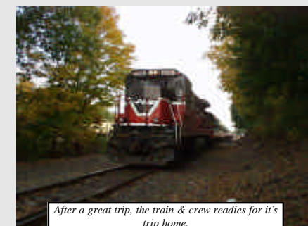
After a great trip, the train & crew readies for it's trip home.