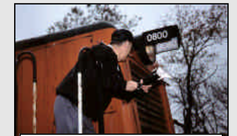
CERM Photographer Bob LaMay surveys the ceremony on the #0800.