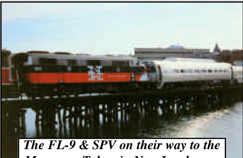
The FL-9 & SPV on their way to the Museum. Taken in New London on P&W train NR-2.