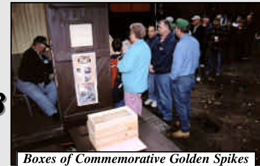
Boxes of Commemorative Golden Spikes await the line of museum visitors forming at the beginning of the day.