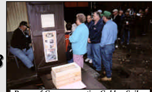
Boxes of Commemorative Golden Spikes await the line of museum visitors forming at the beginning of the day.