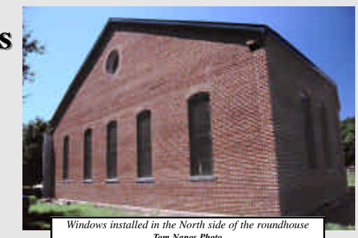
Windows installed in the North side of the roundhouse

Connecticut Eastern Railroad Museum & Connecticut Eastern Chapter, NRHS, Inc. P.O. Box 665 Willimantic, CT 06226