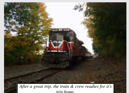
After a great trip, the train & crew readies for it's trip home.