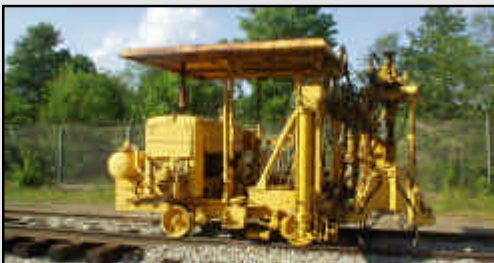
Motorized tamper after purchase from the U.S. Navy.