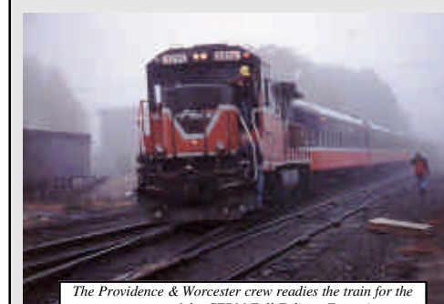
The Providence & Worcester crew readies the train for the passengers of the CERM Fall Foliage Excursion