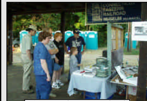
Visitors at the Museum booth at the Hebron Harvest Fair.