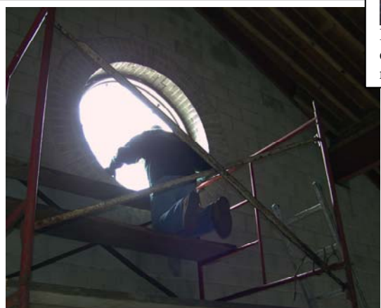
In this photo Adrian Adkins can be seen giving the circular window a close look to determine how it will be removed.