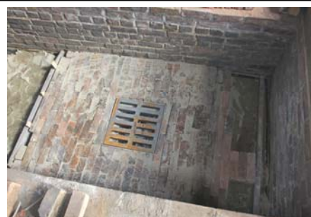
This photo shows the new liner installed in Pit number 2.