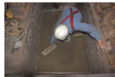
Adrian Adkins smooths the sand area base around the drainage grate before he applies a layer of bricks.

While the roundhouse work continues another project continues inside stall number 5. Here the Central Vermont Railway Center Cupola number 4052 is going through a complete ground up restoration. This will end of being a Multi-year project.