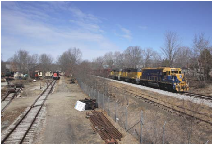
New England Central Train 608 moves south with Train 608 after cars dropped off the night before on the DeVivo siding. I heard the train crew referring to their as 'at the Gallows'.