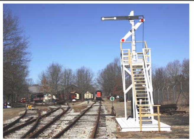
This recent photo shows the recently constructed 'Gallows Signal' about 90% complete. Primer needs to be added and a final coat. A special dedication ceremony is scheduled for May 21, 2011 at High Noon.