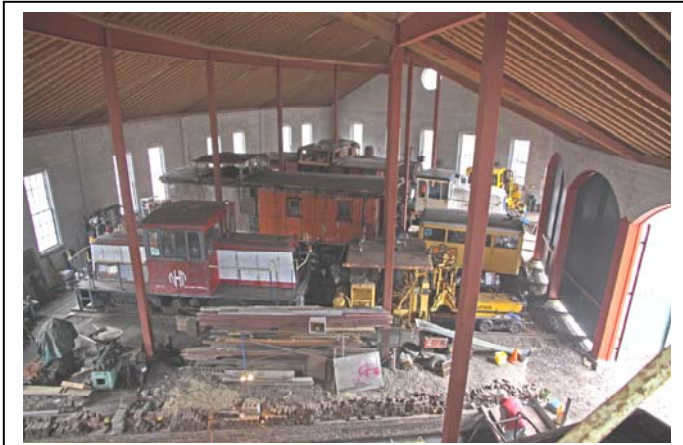
Special scaffolding was set up to take down the 5' large window for repairs. Here is a photo taken from that location. Note eight different pieces of railroad equipment. In the lower section of the photo the restoration of Pit #2 can be seen.