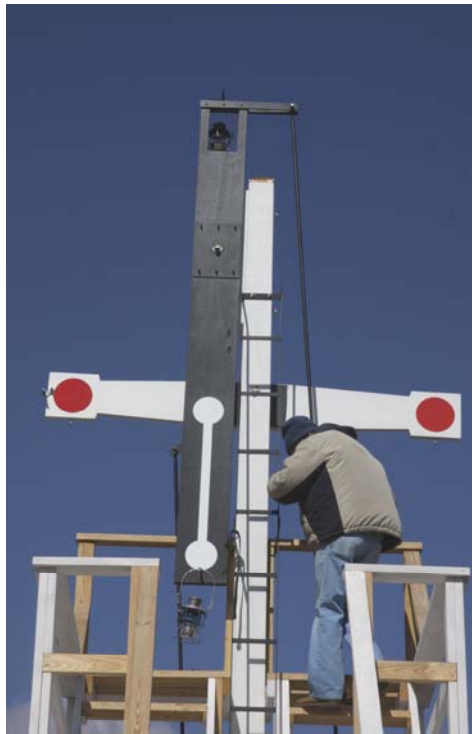
Dick Arnold checks lanterns when the black sign board was in the vertical position. Both the upper and lower lantern was visible from the tracks.