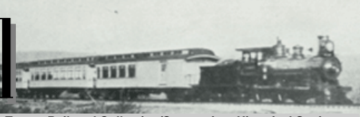
Photo from last year's Night Photo Shoot