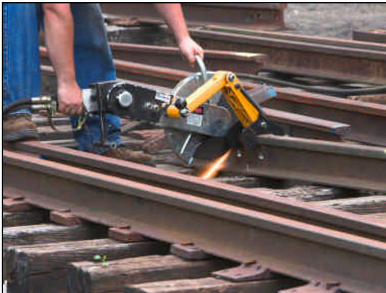
Cutting rail for the new switch.