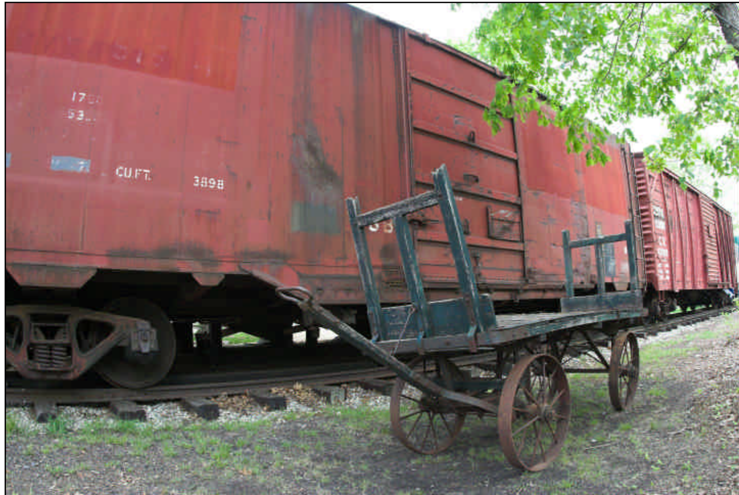
A view of a baggage cart next to the boxcars on the Groton Freight House siding.