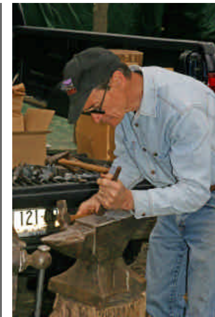
During another demonstration a blacksmith is seeing stars at the 1 st Annual Heritage Metal Fest