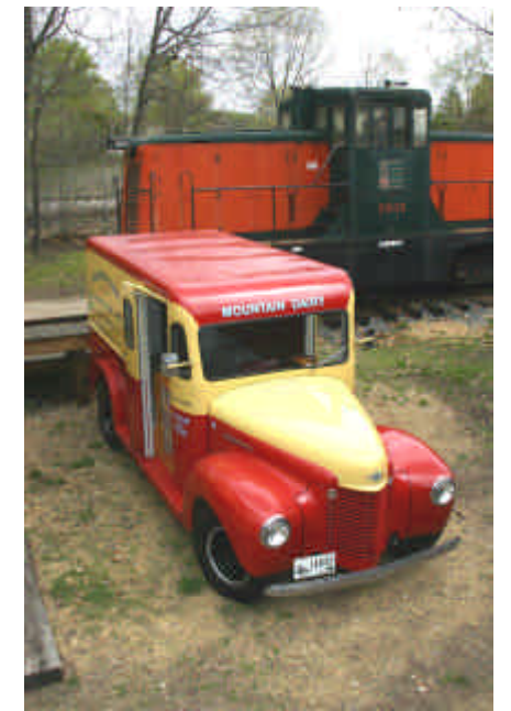
Hosmer Mountain's truck poses at loading dock of the Chaplin Station during the 1 st Annual Heritage Metal Fest