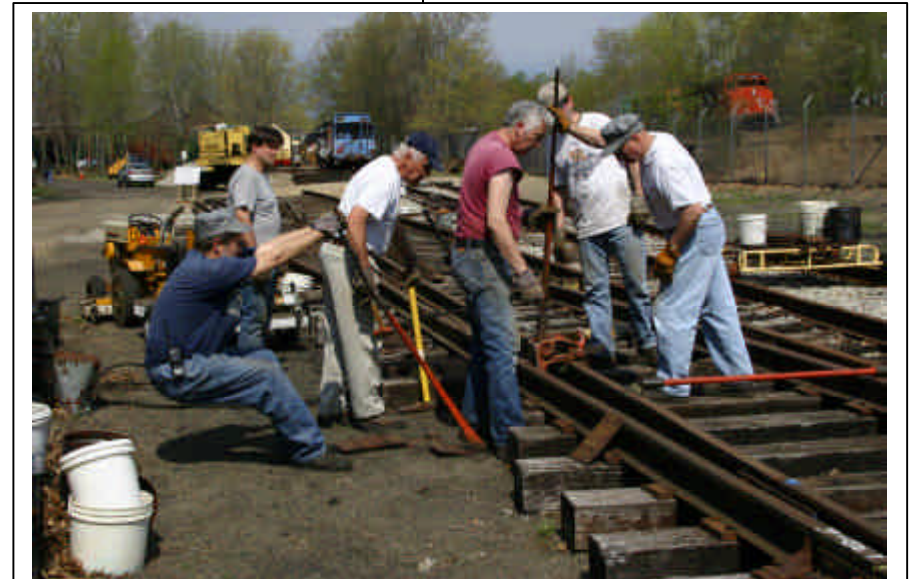
Members of the work the switches that will eventually see track going to the Columbia Junction Roundhouse turntable area. Note that during the hard labor New England Central's train 608 rolls by heading south.