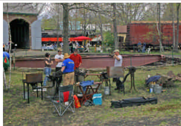
A number of smithies that attended the 1 st Annual Heritage metal Fest held May 6, 2006. Here we see various groups set-up around the turntable area. Numerous patrons visited the museum to see this event.

There is a lot of activity taking place at the museum every weekend. Track laying is on-going in order to meet one of the museum's goals which is having track completed to the roundhouse pit. Track work will be taking place in the museum in order for the restoration of the Central Vermont #4052 caboose to begin. There are a dozen 'Rhythm on the Rails' concerts planned from May 20 th to September 30 th . Please try to attend one or more. The first concert is planned for Sat. May 20 th at 2:30PM. The ever popular Tara's Thistle will be returning again. The 3 rd Annual Night Photo Shoot will be 6/10/06.