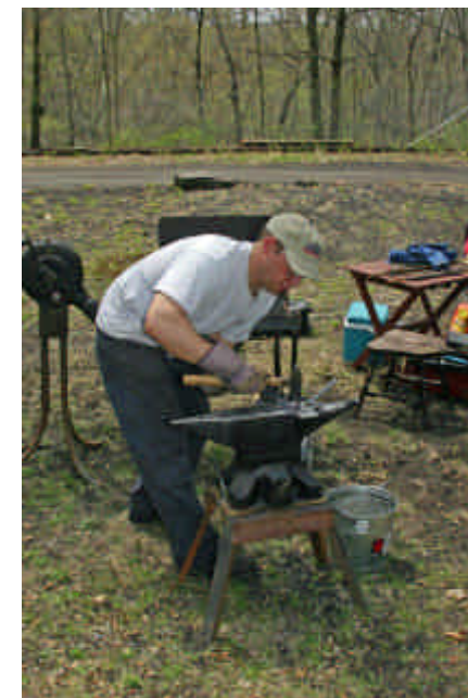
Another blacksmith show how to bend hot metal during the 1 st Annual Heritage Metal Fest.