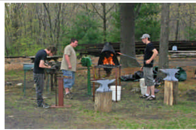
In this photo we see some of the metal working students from the Assabet Valley Vocational Technical High School located in Massachusetts. They were part of the 1 st Annual Heritage Metal Fest held 5/6/06.

Connecticut Eastern Railroad Chapter, NRHS, Inc. PO Box 665 Williamantic, CT 06226