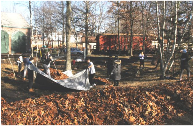
This photo shows a number of the students raking and moving leaves to a pick-up area nearby. A lot of leaves were moved that morning. Thanks to everyone involved.