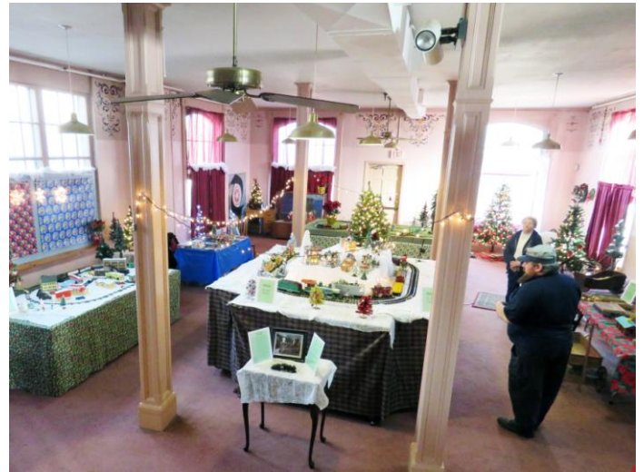
This photo shows the joint Trees, Trains & Toys display at the Mill Museum. It will be open weekends until 01/03/2016

Connecticut Eastern Chapter, NRHS, Inc. Connecticut Eastern Railroad Museum PO Box 665 Willimantic, CT 06226