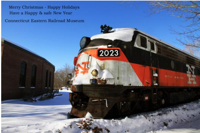
Merry Christmas - Happy Holidays Have a Happy & safe New Year Connecticut Eastern Railroad Museum

We at the Connecticut Eastern Railroad Museum wish everyone A Merry Christmas and Happy New Year. Come and see us in 2016 – we'll have more happy adventures for you to experience.